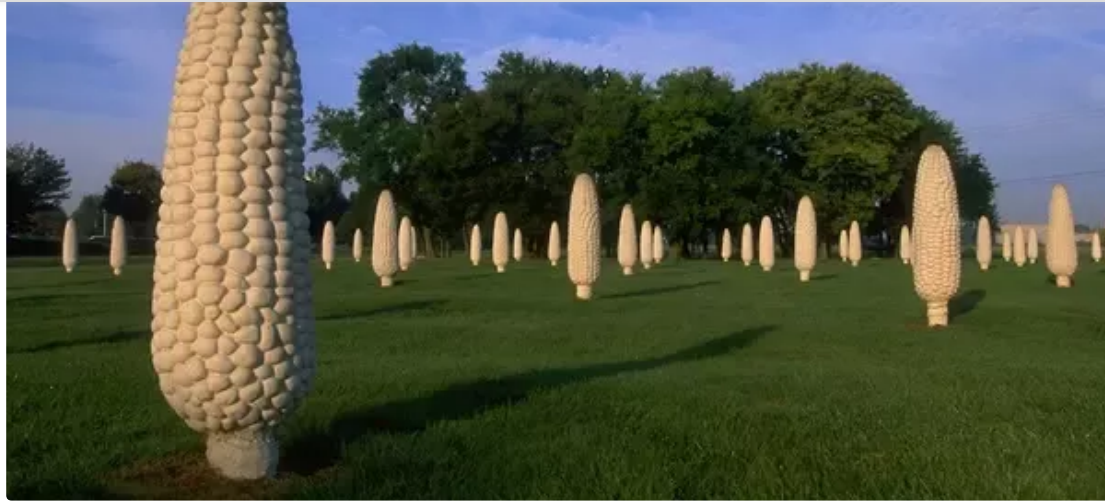
[image of concrete pillars of shucked corn on a perfectly mowed lawn]