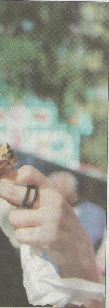
ate on a hot day at Pumpkin Show.