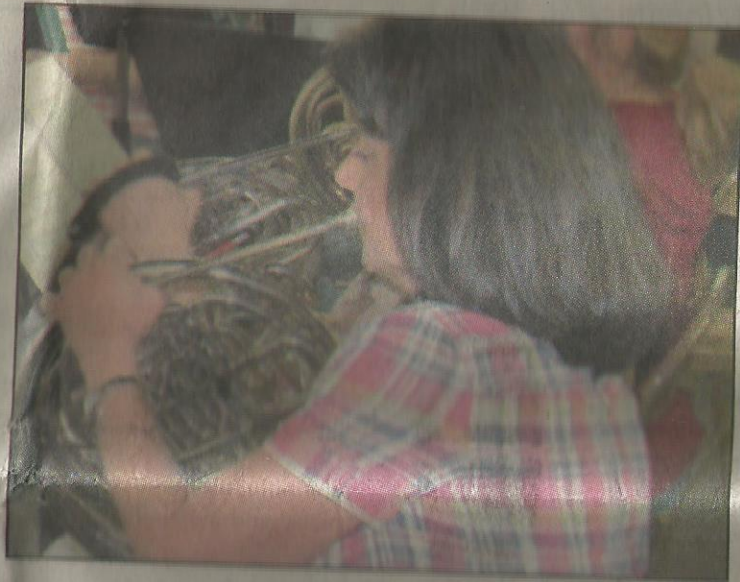
The Pumpkin Show Band has concerts planned at the Circleville-Pickaway Visitors Pavilion.

Wednesday, 9 a.m., at Court and Main streets.